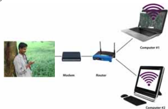
Figure 2 Integrated extension delivery model with soil, weather and crop data

When person makes his call from his project, the location, GPS nodes, Soil status, nutritional status, crop condition, will be known along with the socio economic conditions of the Person. The information so obtained can be linked to the existing or previous cropping pattern and the weather parameters with the existing weather based websites vizaccu weather or even IMD website. Thus with just a phonecall the nodal Information delivery system (presently District Agricultural Advisory and Transfer of Technology Centre) will get the information about the Person, Project, Crop and weather. Then with the help of the uploaded pixels regarding the existing pests, diseases and nutrition deficiency symptoms through the smartphone necessary advisory can be easily and precisely can be given to the farmer. This extension transfer of technology model has got the further scope of using the cloud technology for integration of all these components for low cost decision support system for the benefit of the small and marginal farmers in this region.